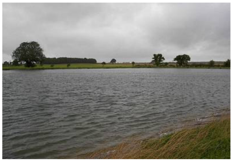
42,000m3 synthetically lined reservoir

Once a club has decided to investigate a reservoir for the course, the first question to address is where might one be sited? Often the club's first conjecture is, 'We have a low part of the course that is wettish in any case, how about there?'