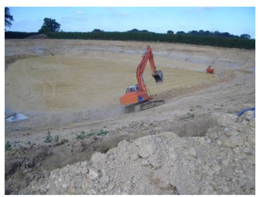
Slope facing at Kent National

Many reservoirs are scraped and pushed into shape by bulldozers and similar plant. Others are constructed using 360 degree excavators and dump trucks. However they are constructed, the most crucial component of the build is the correct specification for the construction of the embankments, and a variety of plant is available for this. All of this plant must be transported to site. Ensuring an adequate and safe haulage route through tight rural roads and across the golf course is an important consideration in the siting of the reservoir and its safety planning.