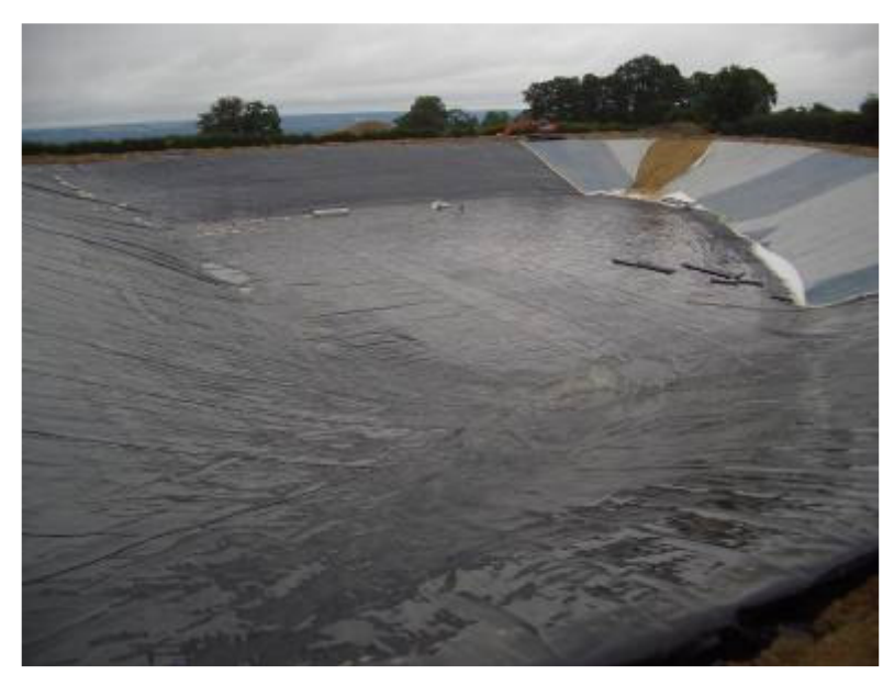
A lined reservoir not far off being ready for filling