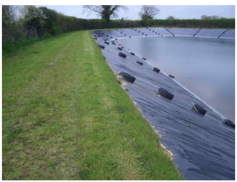
Finished embankment surface

The purpose of the golf reservoir is to store water so that it can be applied through the irrigation system in the summer. Though construction must be seen as an individual project, the reservoir is just one component of a larger system – from the collection of the water, through to its emission from the sprinklers' nozzles. Fitting the reservoir into the overall abstraction and irrigation system must not be left to chance.