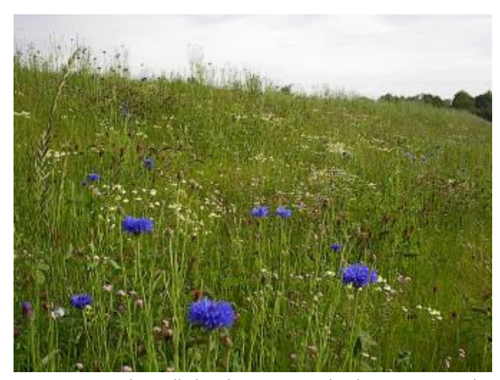
Synthetically lined reservoir embankment sown with a wildflower seed mix

the only animals that need to be excluded are deer, foxes, rabbits and, of course, pet dogs. Using wildflower seed blends can provide a valuable habitat for small rodents and birds.