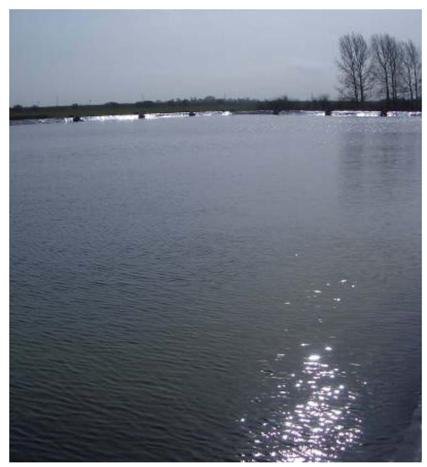
13,500m3 reservoir for greens tees and approaches at Spalding Golf Club

Observing the structure of the substrate, testing its on-site strength and compressibility, removing samples and analysing them as required in a laboratory will give a good indication as to all the elevations and slope angles needed on the finished structure. It will also allow the maximum depth of excavation to be set. Correct slope angles and a detailed specification for the embankment construction methodology is critical to the long term stability of the reservoir structure. Only on-site investigation and geotechnical examination will ensure that, with the correct safety factor, a reservoir's embankments will pass the 100 year test mark.